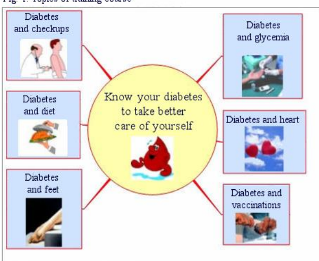
Fig. 1: Topics of training course

To this schedule it has added the relevant part to the knowledge of the National Health System and of the relationship of the treating consultant.